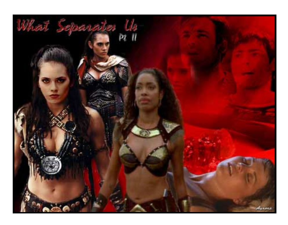
Production #XWP185/SS51 Episode #9.04

Story By: Aurora, Ryan and LadyKate Head Writer: LadyKate Co-Writer: Aurora Edited By: LadyKate Collage By: Aurora Images Gathered By: Aurora