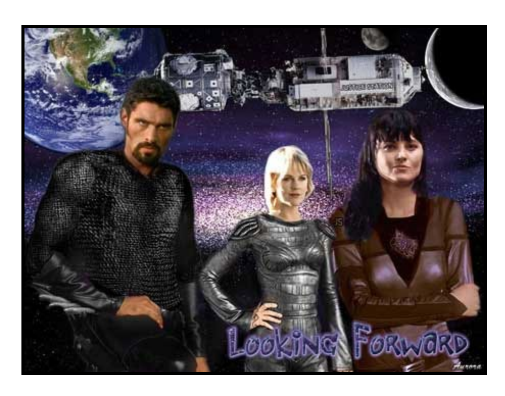
Production #XWP182/SS48 Episode #9.01

Story By: LadyKate and Tango Written By: LadyKate and Tango Collage By: Aurora Images Gathered By: Aurora