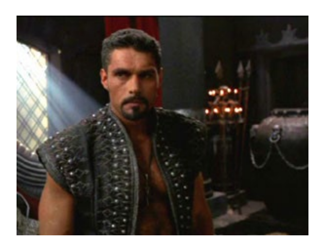
Has been hurting so long

Frowning, Ares asks Xena something. She shrugs, turns and walks away. Ares somberly watches her leave.