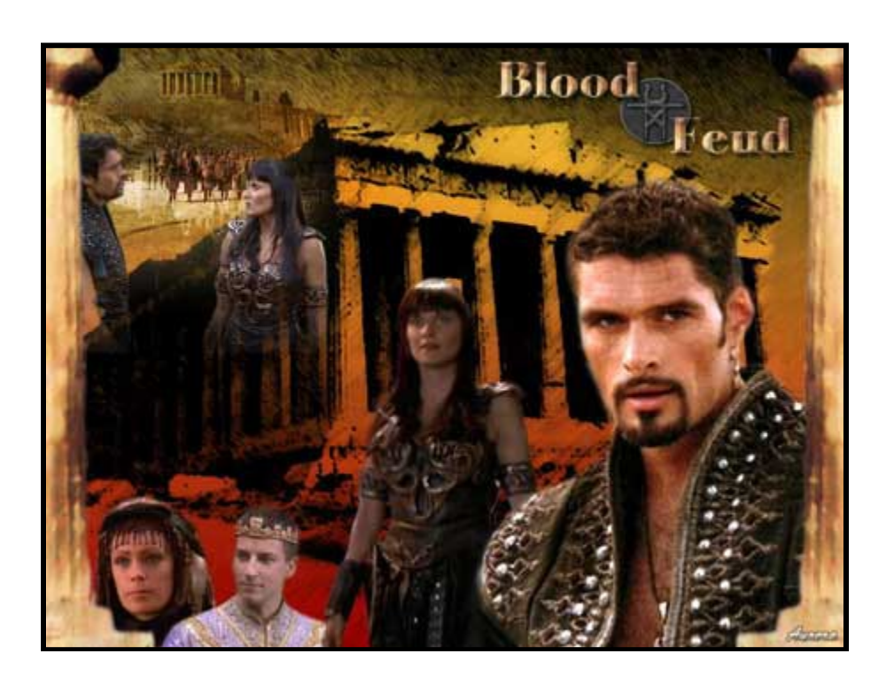
Production #XWP179/SS45 Episode #8.21

Story By: LadyKate, Aurora and Tango Written By: Aurora and LadyKate Edited By: LadyKate Collage By: Aurora Images Gathered By: Aurora