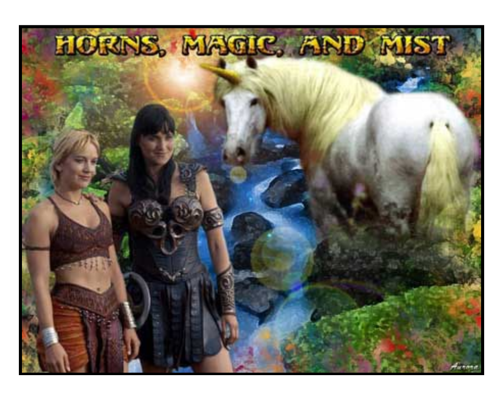
Production #XWP170/SS36 Episode #8.12

Story By: Aurora and LadyKate Written By: Aurora and LadyKate Edited By: LadyKate and Tango Collage By: Aurora Images Gathered By: Aurora