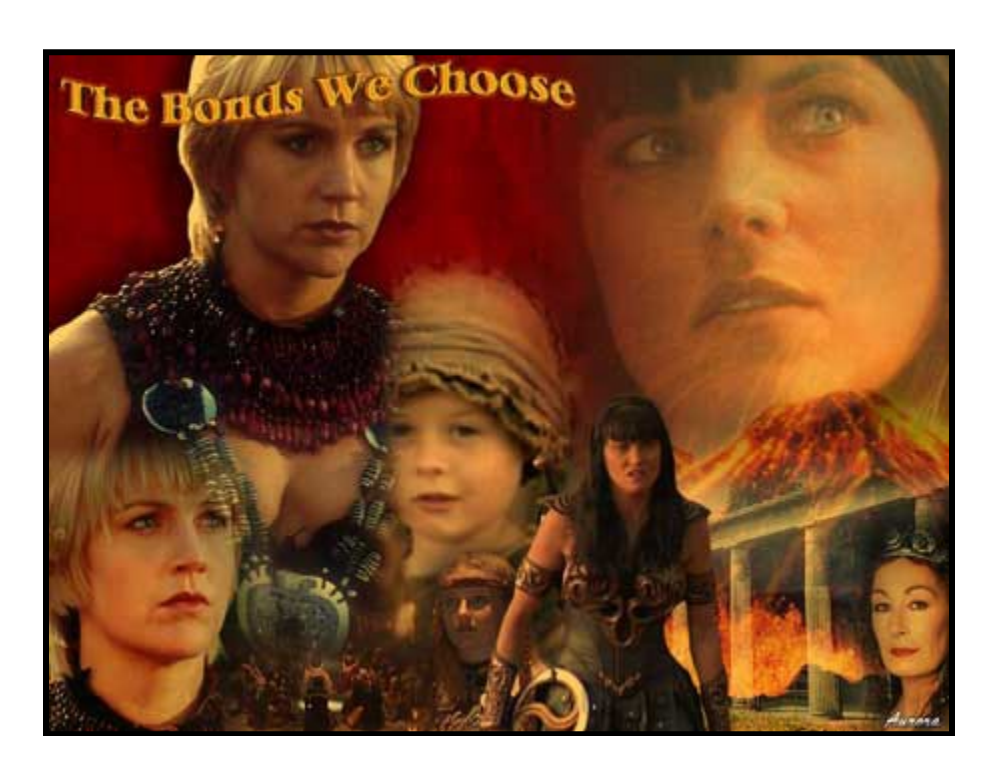
Production #XWP159/SS25 Episode #8.01

Story By: LadyKate and Sais 2 Cool Written By: LadyKate and Sais 2 Cool Collage By: Aurora Images Gathered By: Aurora