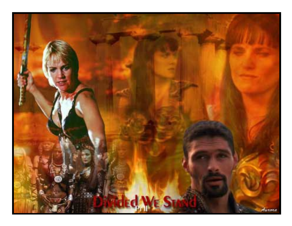
Production #XWP158/SS24 Episode #7.24

Story By: LadyKate and Sais 2 Cool Written By: LadyKate and Sais 2 Cool Collage By: Aurora Images Gathered By: Aurora