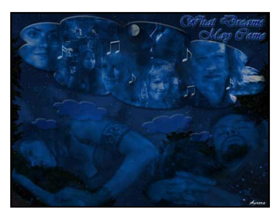
Production #XWP155/SS21 Episode #7.21

Story By: Aurora Written By: Aurora Edited By: Amber and LadyKate Collage By: Aurora Images Gathered By: Aurora