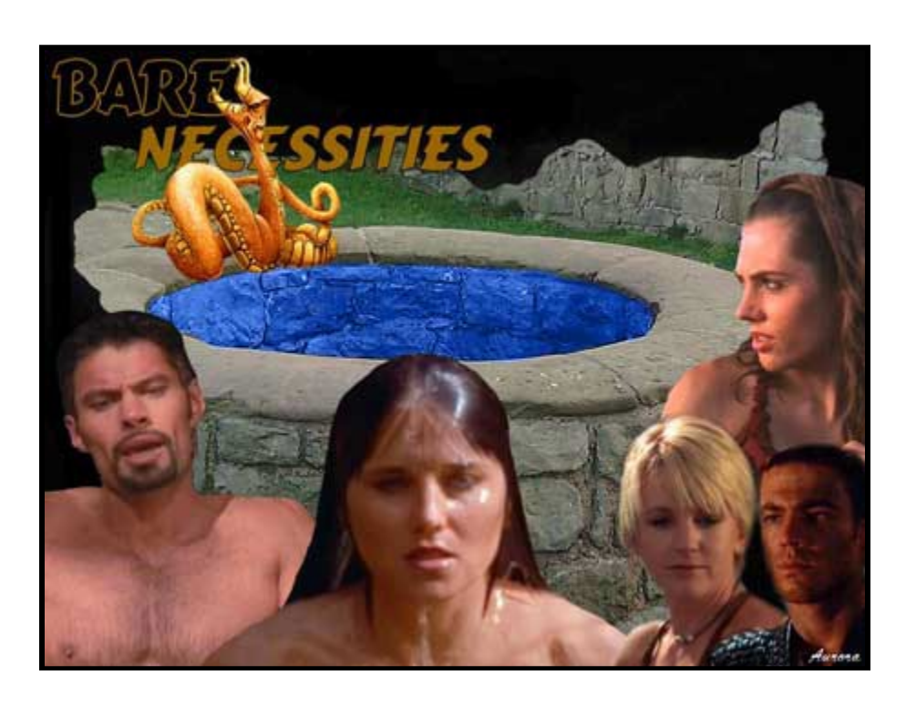
Production #XWP151/SS17 Episode #7.17

Story By: Aurora Written By: Aurora Edited By: Amber, LadyKate and Tango Story Inspired By: Maureen Collage By: Aurora Images Gathered By: Aurora