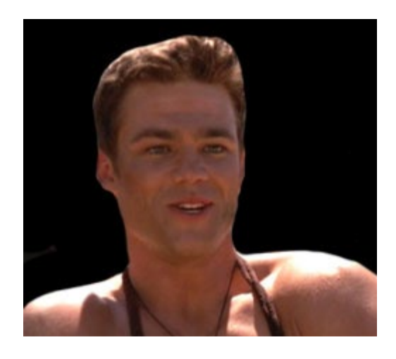
VIRGIL (coming over to where the other three are sitting): Look who's here!