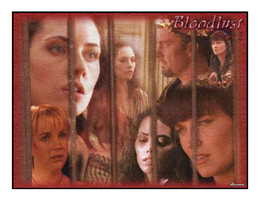
Production #XWP139/SS05 Episode #7.05

Story By: Amber Written By: Amber Collage By: Aurora Images Gathered By: Aurora